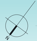
LEASING PLAN SCALE: 1 : 300